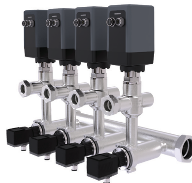
Multi-channel flow control loop for temperature control in extrusion, injection molding and pressure-casting processes.

Want to know more? Contact us: +49 (0)79 40 10-0